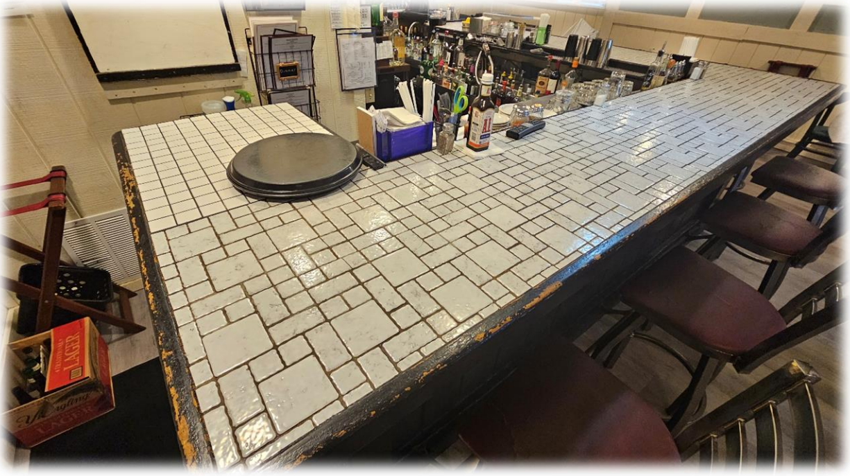
Peninsula to be made shorter to create larger entrance way.