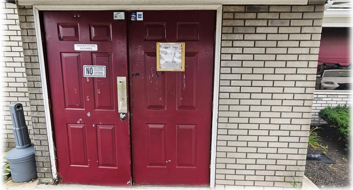
Door to be replaced in kind