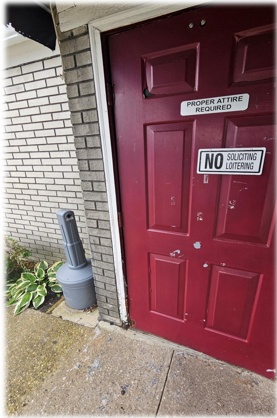
Door shows signs of significant rot.