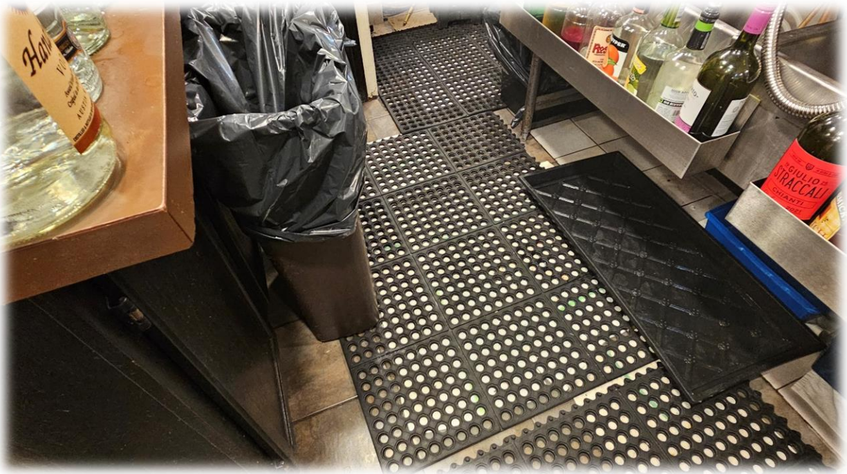
Floor to be replaced as an alternate