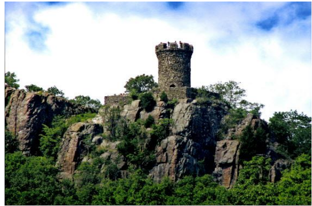
Castle Craig, Meriden CT