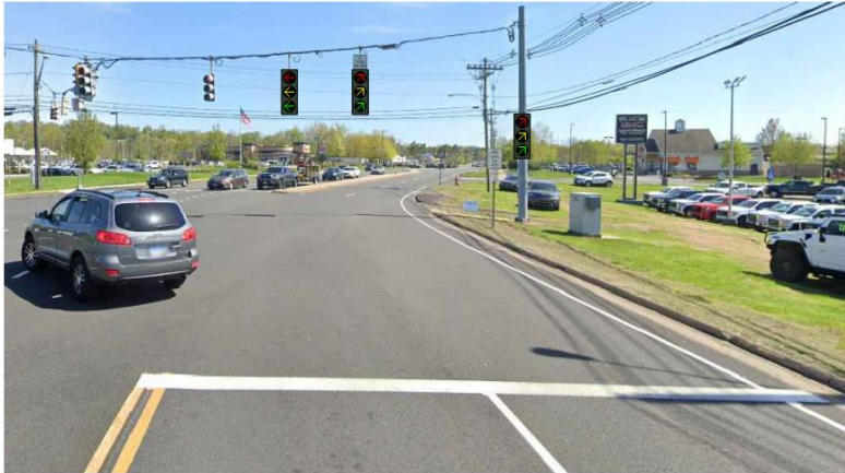
Replace existing signal heads with 12" 3-section heads, and add supplemental signal head on span pole.